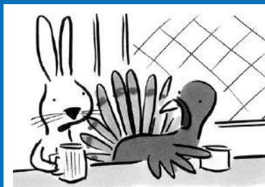
Take the groundhog - now that's a sweet gig.”